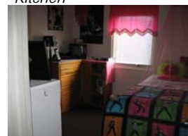
Bedroom (View 1)