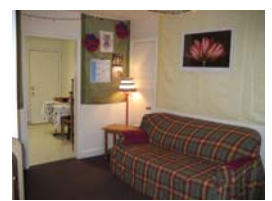
Living Room (View 2)