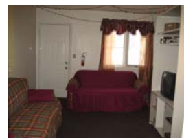
Living Room (View 1)