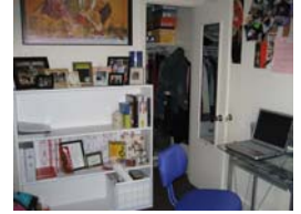
Bedroom (View 2)